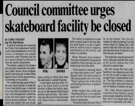
1979 Skate park Opens