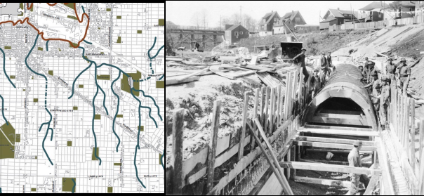
China Creek Watershed drains major part of East Van