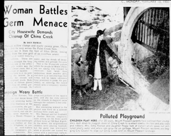
China Creek Ravine becomes a City Dump and is filled in and transformed into a park