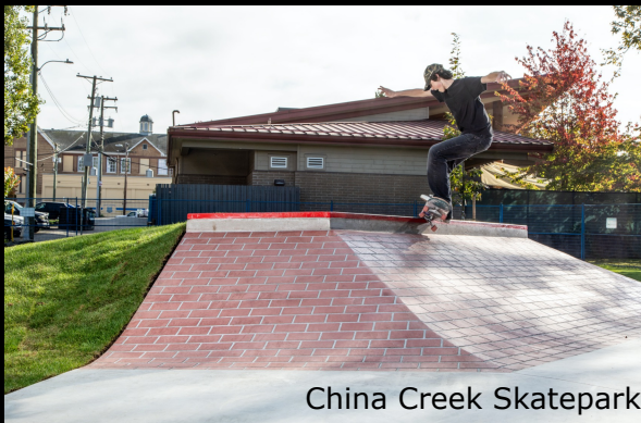
China Creek Skatepark