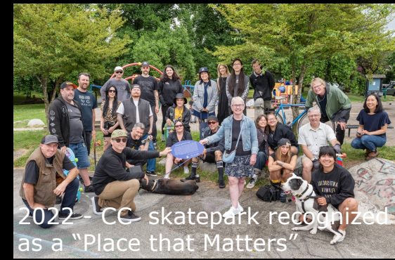
2022 - CC skatepark recognized as a "Place that Matters"