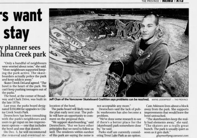
40th Anniversary of skatepark