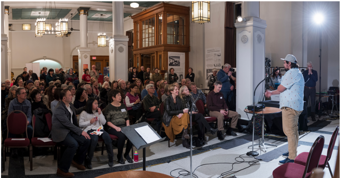
PTM COMMUNITY CELEBRATION 2020 AT HERITAGE HALL

Since 2018, the event has grown in size and is being reimagined as two separate events for 2024.