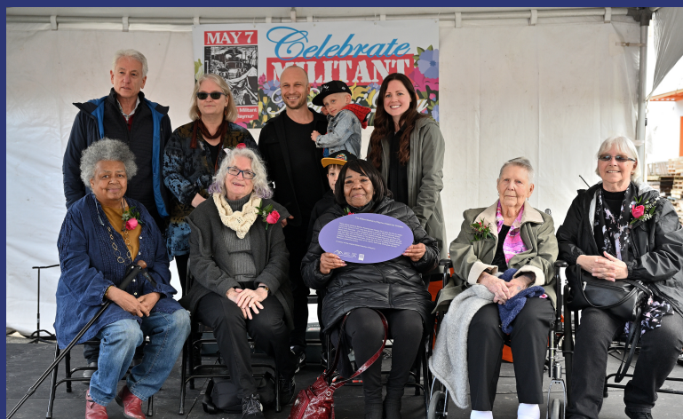
MILITANT MOTHERS OF RAYMUR 2022

VHF will assist in documenting the event through photography and basic video recording which will be made available after the event, for our records, for the website and for your use.