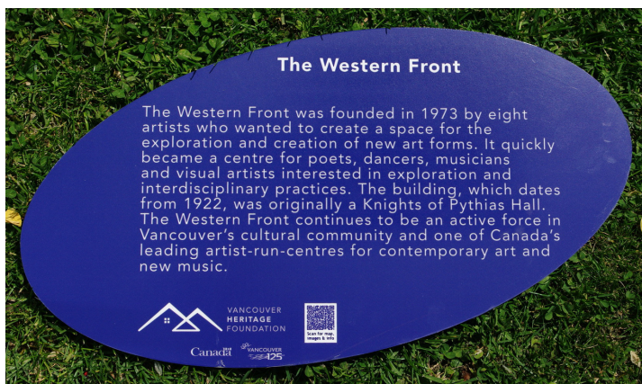
THE WESTERN FRONT PLAQUE BY VHF

Depending on your site, all possible installation options will be explored. VHF will assist in determining who owns the property on which a plaque may be installed. Affixing it to an exterior location is preferred for public access but may require maintenance. Cooperation with other site owners may be required. VHF will assist in this process and provide clear direction on what type of installation is recommended.